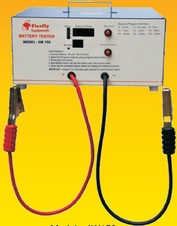
Model:- 4W150 32Ah to 150/180Ah (6 steps - nearest mode option)